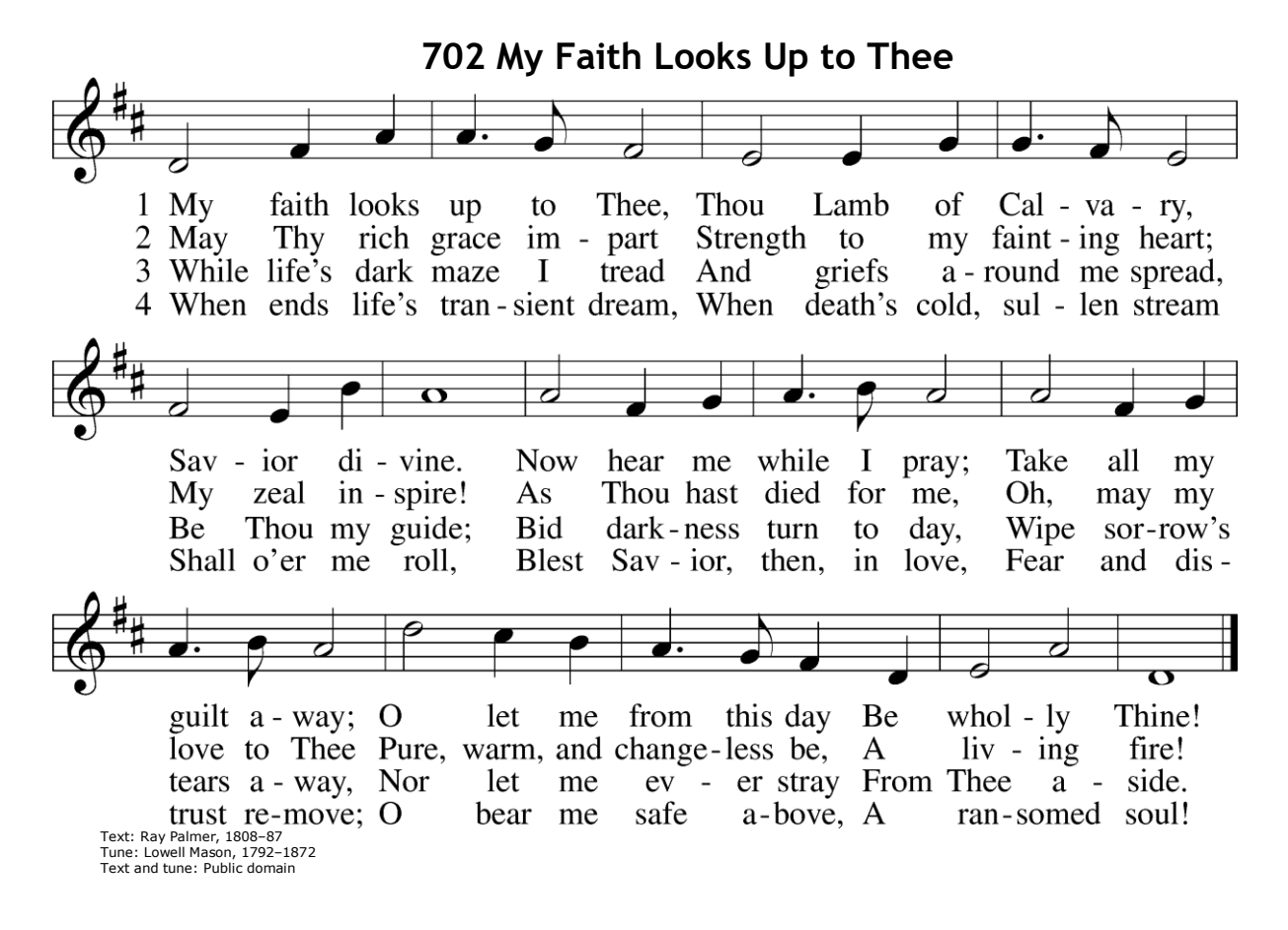
John 1:29, 36; Hebrews 12:2–3; Ephesians 3:12; Revelation 2:10–11