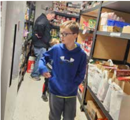
Students helped collect and organize food pantry items at Divine Shepherd, Black Hawk.

Recently, students in our South Dakota Lutheran schools had the opportunity to: